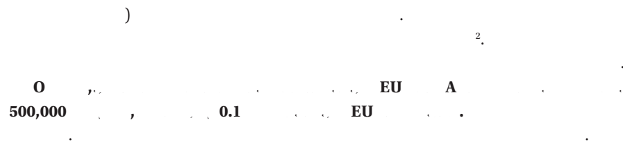
Figure 2: First residence permits in EU28 to African citizens by citizenship